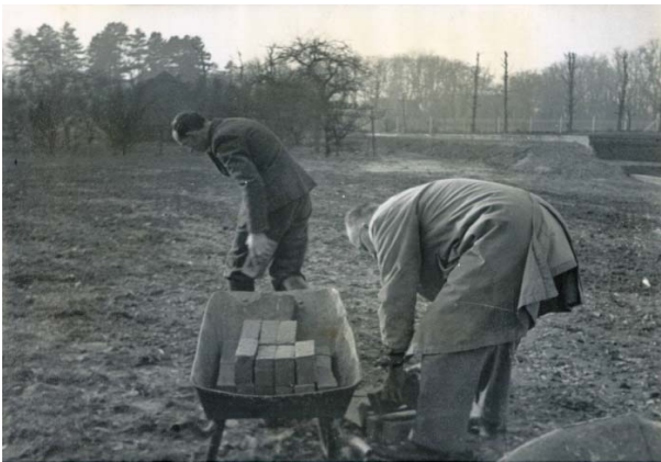
Laying out the Brick Stacks for the piers - 1952 (IPB-0274)