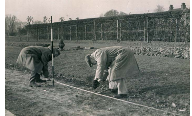
The Setting out of the Tennis Court Straight - 1952 (IPB-0276)