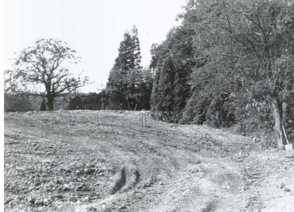
Track Build Start - 1952 (IPB-0013)