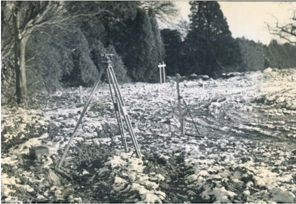
Early levelling of the site - 1952 (IPB-0256)