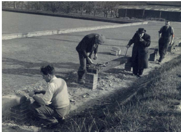
Laying the wooden sleepers on brick pillars along the Bowling Green Straight - 1952 (IPB-0272)